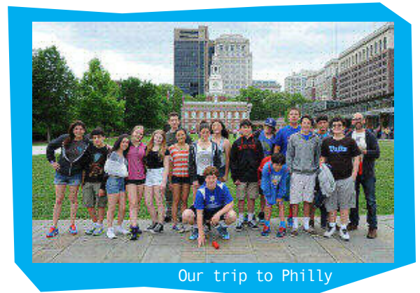
Our trip to Philly