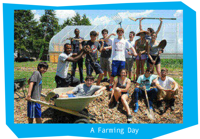
A Farming Day

remember YOUR connections are what make RSNS teen programming strong!